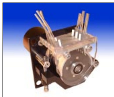
400F/DM3 compact instrument quality three channel pump