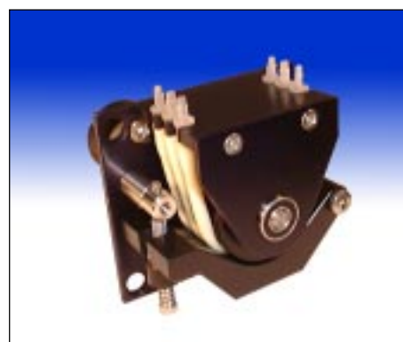
400F/D3 compact instrument quality three channel pump