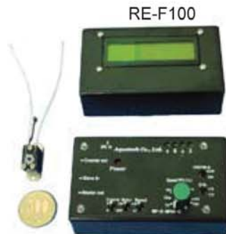
Driver controller and display